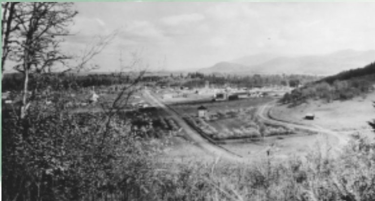
View to the northwest (circa 1904). Grassland and young oak trees in foreground. Junction of Summit Avenue and Fairmount Blvd. at right. Note oak woodland on hillside. Courtesy of Lane Co. Historical Museum. Courtesy of Lane Co. Historical Museum.

When Eugene's population exceeded 3,000 in 1900, local businessmen and the city government focused on improvements and expansion, requesting updated street lighting, a new water system and a modern library. In 1906, Mayor Wilkins recommended to the city council the building up of our city, and directed that a site be selected for a city park. Wilkins had also discussed the idea of a city park with his friend and neighbor, Thomas G. Hendricks, after the two families had enjoyed a picnic gathering on the east ridgeline near the once Fairmount Park and noted the panoramic view.