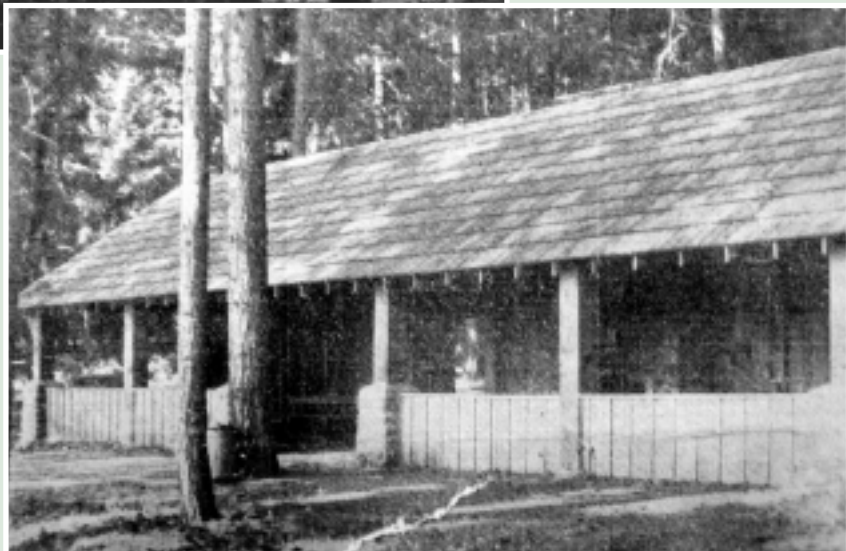
Front page picture in August 7, 1938 Register-Guard newspaper when the WPA building was dedicated to Wilkins. The Willamette River could be seen to the east from the shelter before trees and homes obstructed the vista.