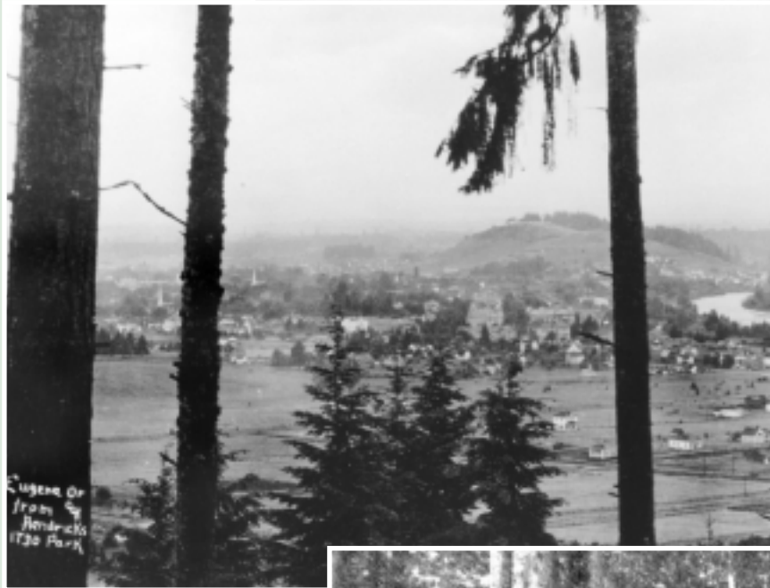
View from Hendricks Park looking northwest, towards Skinner's Butte. University of Oregon campus in center. circa 1908.