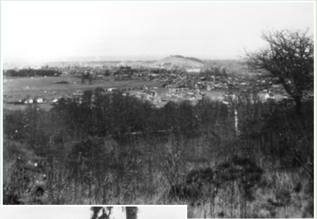
A 1915 overview of Eugene from Hendricks Park.