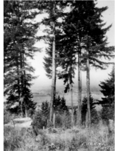
When this 1908 photograph was taken, stands of Douglas-fir were well-established.