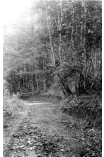
A 1908 photograph shows a recent road cut in Hendricks Park. Some roads have become part of the trail system.